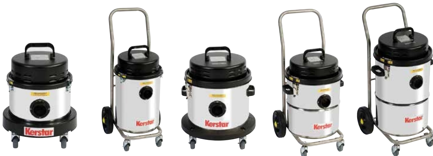
KAV 15, 18, 20, 30 and 45